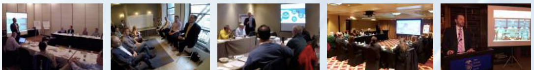
For Private, Public, and Nonprofit Organizations