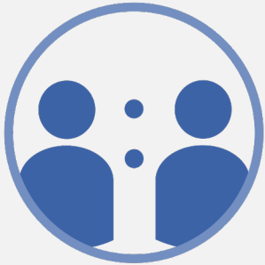
1:1 Coaching Sessions