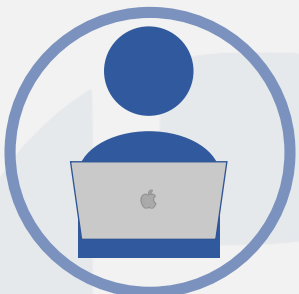
Online / On-Demand