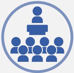
Group Coaching Sessions